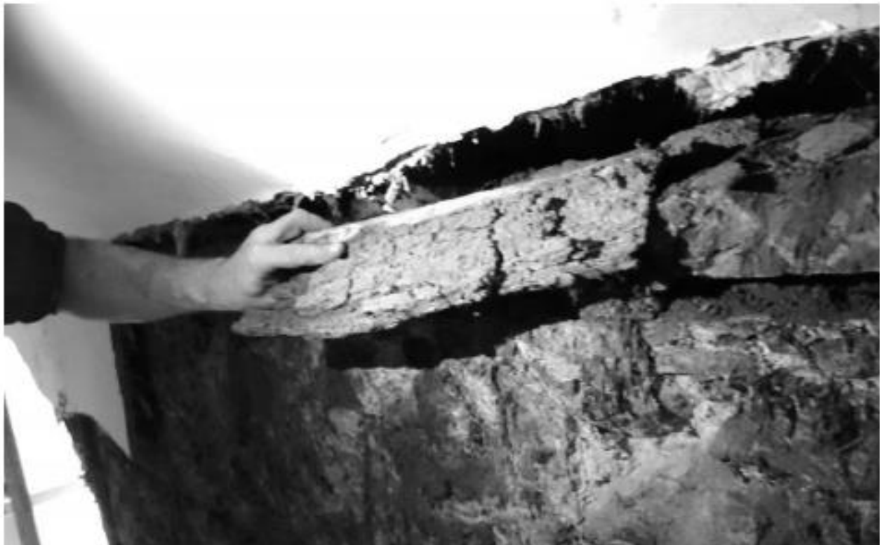
This piece of wood used to run along the top of the wall!

But there is a Catch-22 situation too, where applications will not be considered if work has already begun. This means that work will probably not be able to start until early 2021 to allow some time for applications to be submitted and responses received.