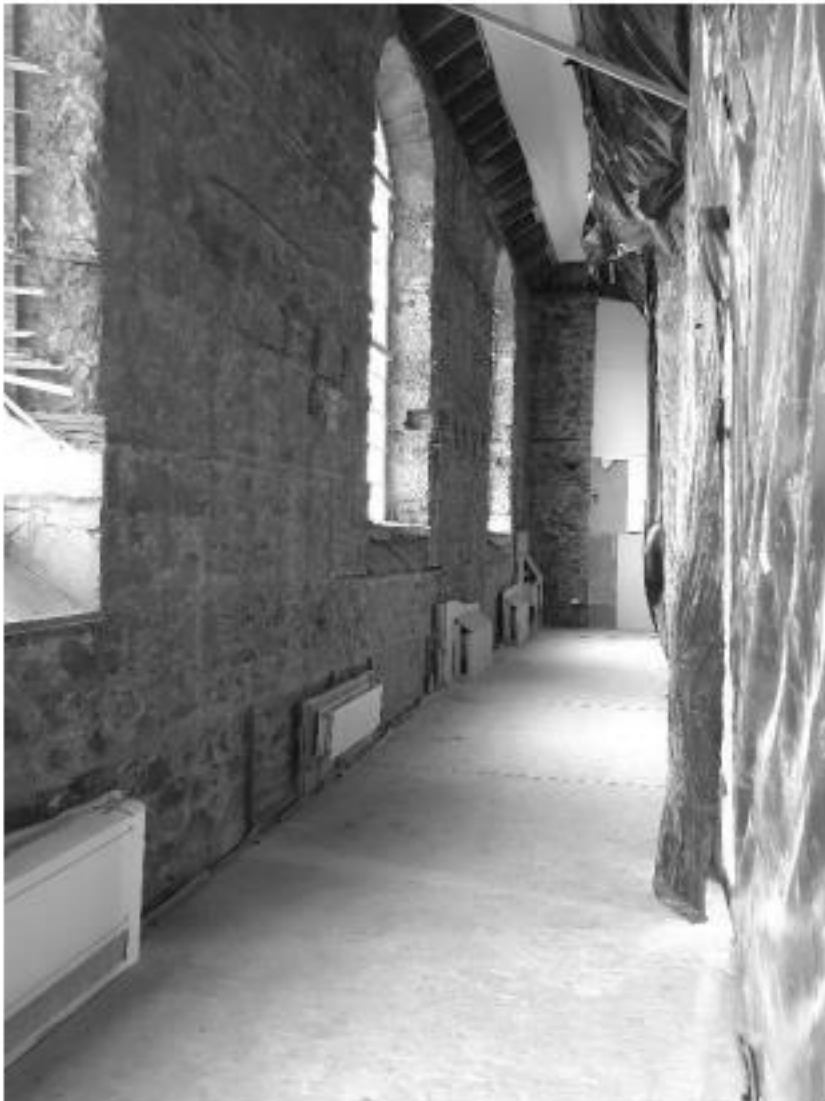
Inside the screen the wall has been stripped to discover the full extent of the problem.