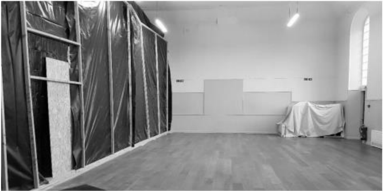
Screen erected to keep dust & dirt inside.